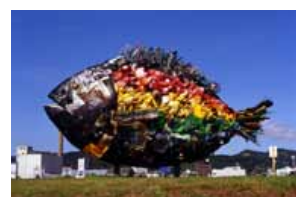
Yodogawa Technique "Chinu, Uno" 2010